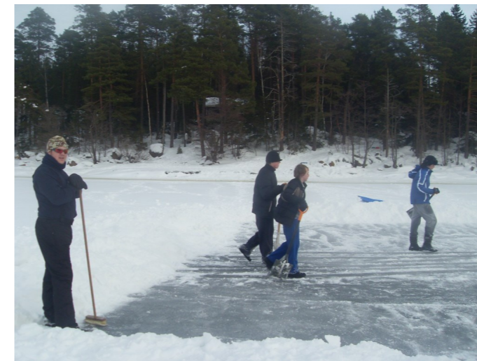
Clearing the snow off the frozen sea can be character building!!