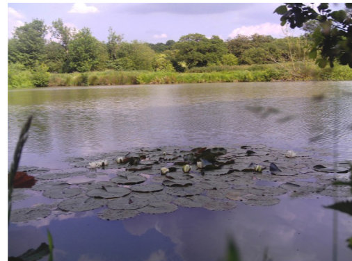
One of the lakes on our nature reserve... Could that be the tent that was stolen in the background? We think so