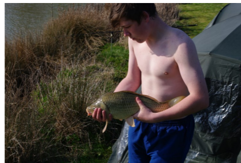
Warm enough for sun cream and Carp!