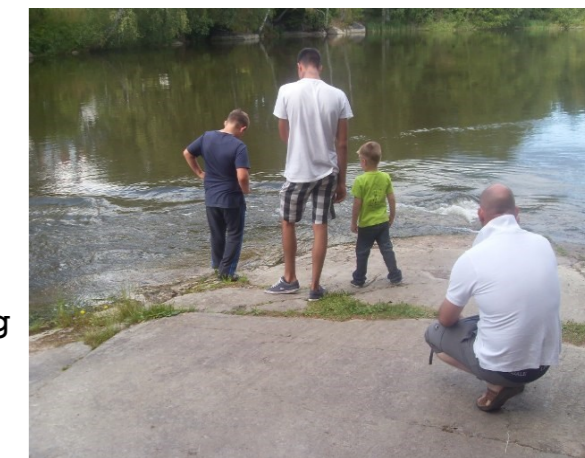
Dads & Lads on The River