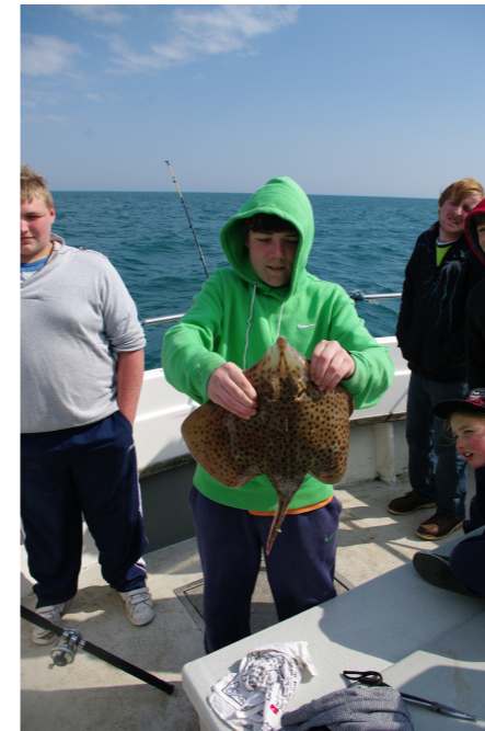
Front Cover Photograph. Deep sea fishing on board Malachi out of Chichester Harbours, Hayling Island.