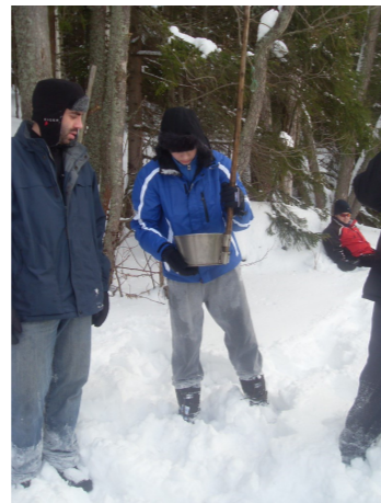
Another gets a drink from the well in the middle of a harsh Finland winter