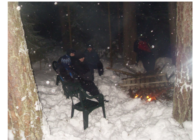
Campfires can be lit and sausages and potatoes cooked, even in such Arctic conditions!