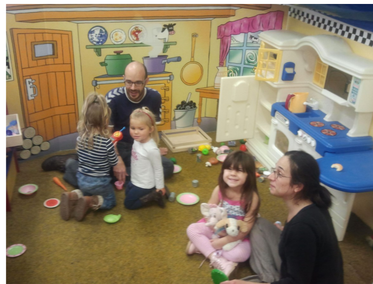
A background partition.