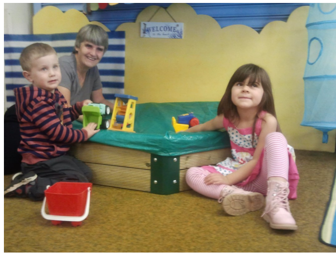
Edward Starr equipment in action. The Sandpit.