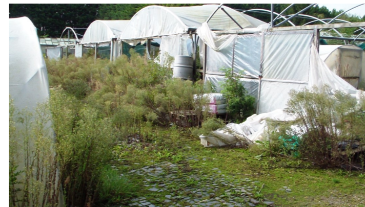
Many Polytunnels that can be used in the Horticultural Centre