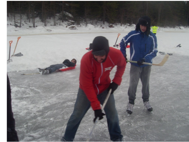
Ice Hockey on The Baltic Sea (well at least for those not resting on their sledges!