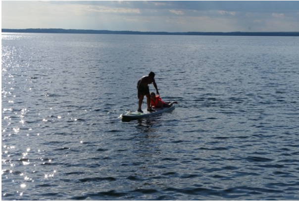
Father and Son Windsurfing on the Dads and Lads Week

We have assembled a few photos here to illustrate those times, please take the time to have a look as they do paint a lovely picture of the personal journey the youngster make and in this the fathers too.