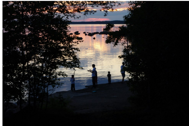
Fishing after dark—Scandinavian style at midnight!