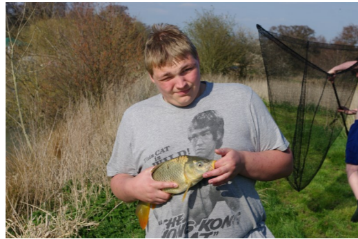
The Fish Obligated