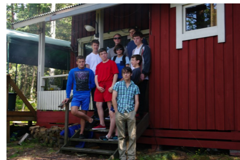
A Group On Our Cottage Steps

"You Can Easily Judge The Character Of Man ... ...By How He Treats Those Who Can Do Nothing For Him!"