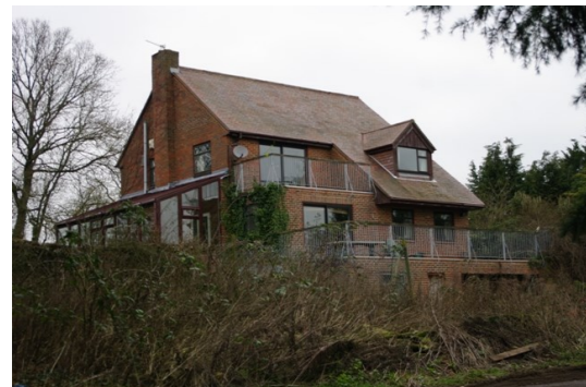
The House We Will use As A Residential Presence In PROJECT TRANSFORMATION