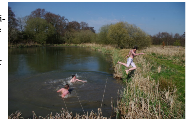
Warm enough in April to Swim in our Lakes... There was a hosepipe ban in effect! Little did we realise what was to come!!

UK readers will have to stretch their minds if not imaginations to verify the truth of this headline! Despite one of the most abysmal summers many of us can remember it all started so well. Easter was amongst the warmest and driest we can remember. We started our 'summer' residential courses at our Nature reserve in Hampshire earlier than we have ever done and as the photos prove, it was warm enough for sun cream and swimming in the lakes!