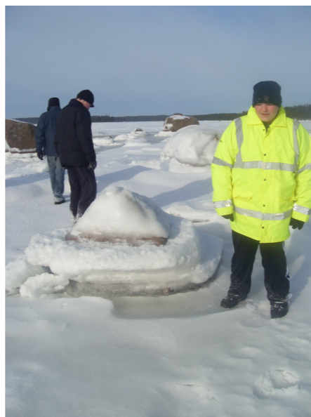
The Beginning of 2012 saw a group of youngsters who had been to the cottage the previous summer in +30 temperatures return to -30! This is education with a capital E!!

On the gable end of our cottage in Finland hangs a maximum and minimum thermometer. It's fun to see what's been happening when we've been away. We just reset it at the end of November and when we did we had a +36 and a -31 showing! We often say that the summers are Mediterranean and the winters Siberian but that really isn't fair because it's simply Finnish, 24 hours of sunshine or 6 hours of daylight! It's all great experience for young people who have never left their inner city district in the UK. It's a great opportunity for social education, learning to live in a group with higher standards than they are used to. Coping with the freezing temperatures and forcing tired limbs through thick snow is all excellent stuff for these youngsters that come from an impoverished background. They learn so much about themselves, how the world works and what advantages can be gained from co-operation. These experiences can be life changing not least for some of them is learning that in nature we have something that they cannot dictate to or even influence... An experience awaiting them in adult life!!