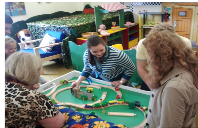
We have had many visiting groups during the year from as far away as Italy and Spain to the West Midlands and Scotland. One such group here didn't come so very far.... 6th Formers from Portsmouth Grammar School!