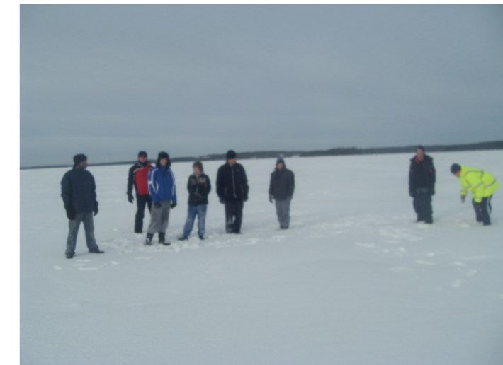
Standing where 6 months previously we were swimming!