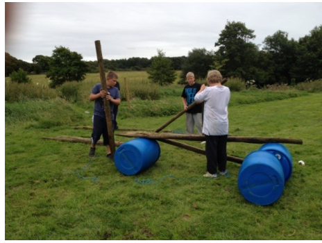
Raft building exercise at our lakes