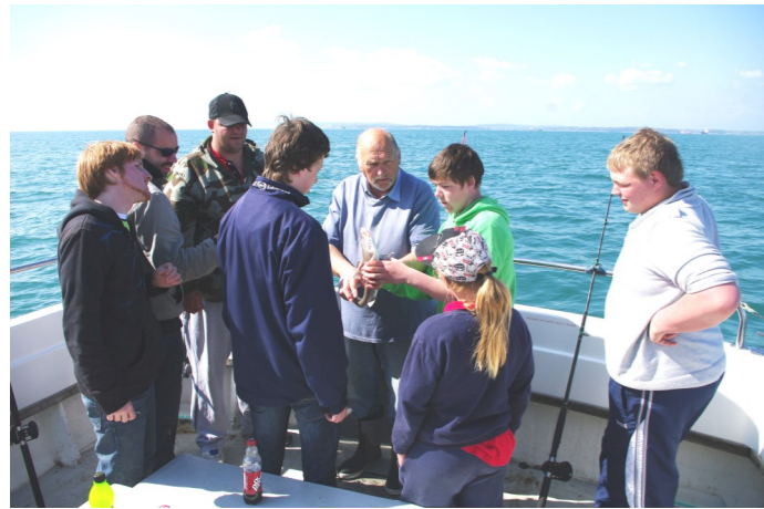
A group get their instructions aboard Malachi