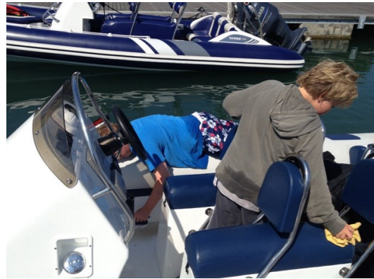
Cleaning the rib after returning from the Isle of Wight