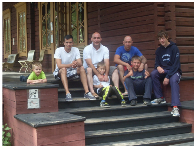
Historical venue, on the steps of the last Zsar of Russia's fishing lodge