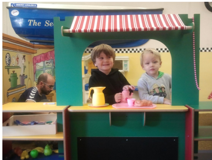
A splendid new kitchen and shop unit.