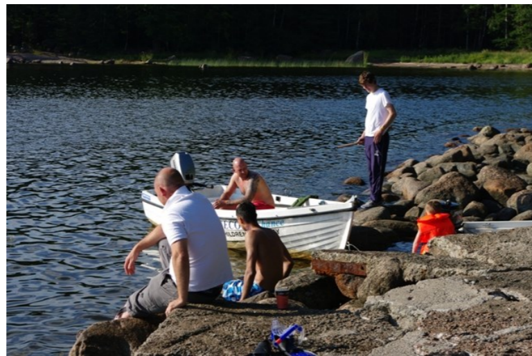
Dads and Lads soak up the sunshine together