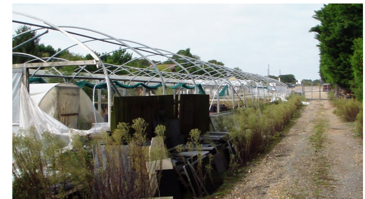
Nearly all tunnels need re covering. Financial and practical help will be required.