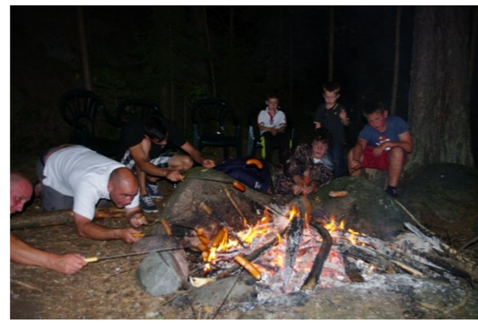
Dads endeavour to show sons how to cook sausages without getting cooked yourself.... Maybe the fire was a tad big on this occasion?!!