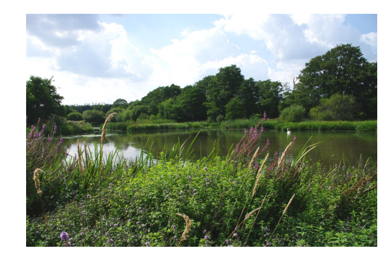
There is a wealth of wildlife from swans and various waterfowl to Water Voles, dragon flies and fish