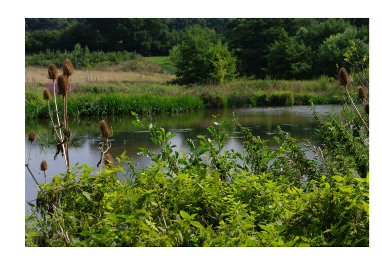
Looking across the wetlands towards the farm, Fish are growing well in this environment.