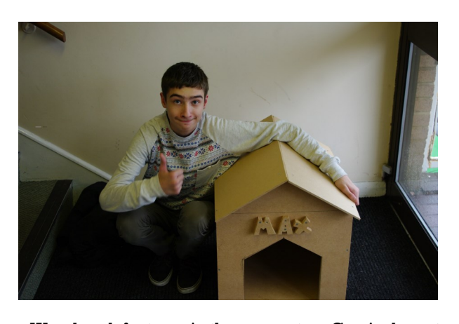
Even Woodwork features in the youngsters Curriculum at Second Chance when on our Back To School scheme.