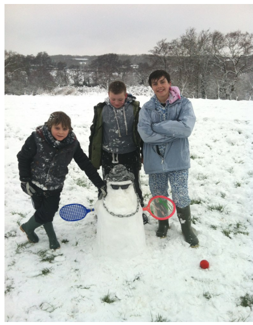
Snowmen Are Always A Winner!