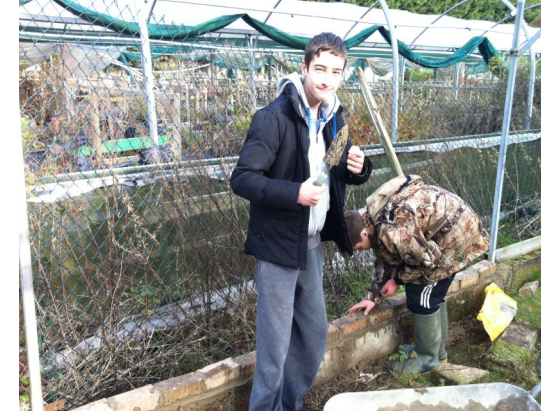
Very Basic Bricklaying Skills Being Learned As They Construct The New Chicken Run!