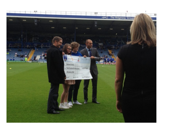
Cheque presentation at Portsmouth Football Club, donation by "Pompey In the Community"