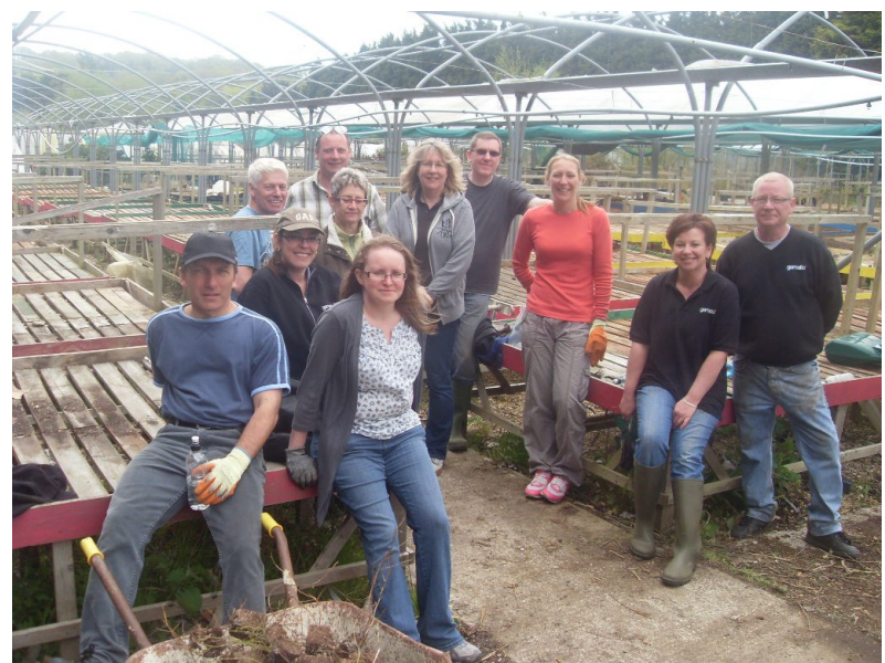
First Gemalto Working Party at the End of The Day in June

Gemalto are a large European company, specialising in security products like Credit Cards. Their presence in Europe strikes a familiar note for us as they have a site on the Segensworth Industrial Estate exactly a mile from our Rural Centre and they also have a site near Helsinki Airport that we pass by each time we go to our cottage in Finland. Gemalto have committed to