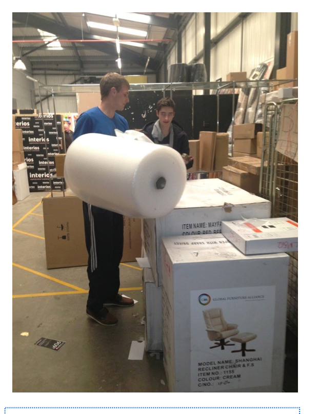
Great Opportunity For Work Experience and Learning Life Skills