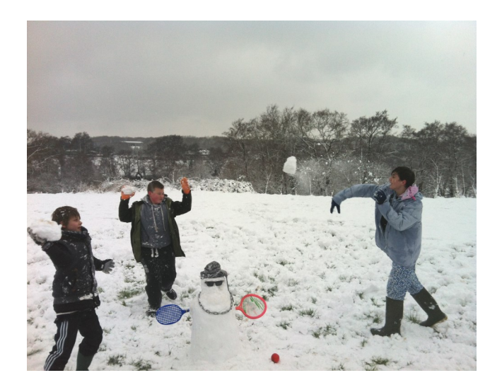
A Snowball Fight Cannot Be Guaranteed Back At Home.