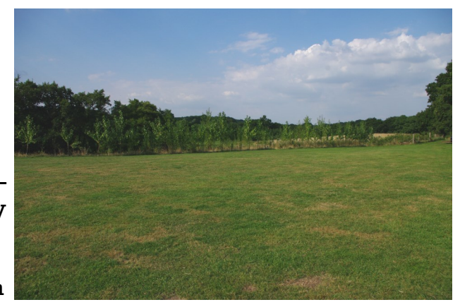
The large Play and Utility Area surrounded by the farm

Just as we enjoyed a good summer we had a great winter too just enough snow to keep the youngsters happy not enough rain to reduce the land to a quagmire. The centre was in use most days with inner city children benefitting from a completely different environment in a safe situation. The Rural Centre is a tremendous resource for us.