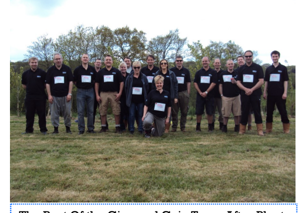
The Rest Of the Give and Gain Team After Planting Trees, Weeding Saplings, Cutting grass, Fencing—A strenuous day, but better than the office!!