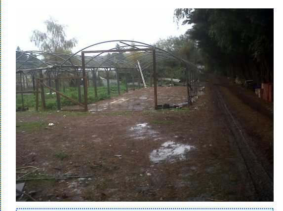
The Finished Work—What A Transformation

Portsmouth Grammar School 'adopted' us for their community outreach day this summer. A small group spent the morning with us learning about our work. 160 of them, the entire 6th form, then joined us for a working party. The many teams made short work of all the clearing and sorting we lined up for them. The pictures tell the story. Thank you Portsmouth Grammar School, you were all stars in our book!