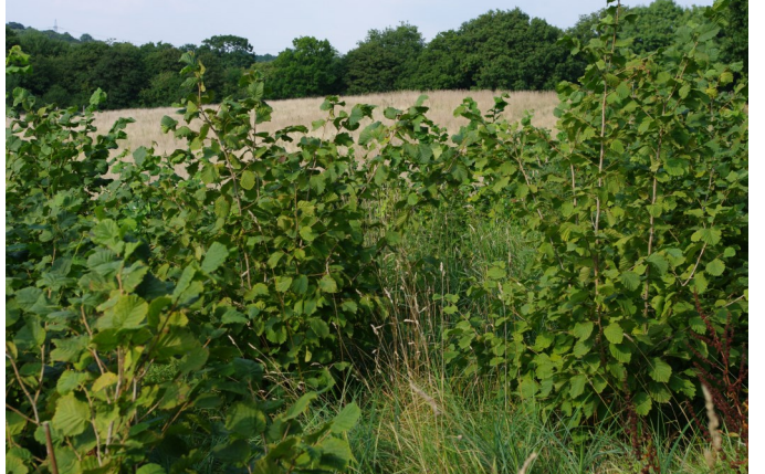
The Hazel Copse Planted Last Year At The 'Give and Gain' volunteering day was the subject of an up keeping day this year and is absolutely thriving with wild daffodils below