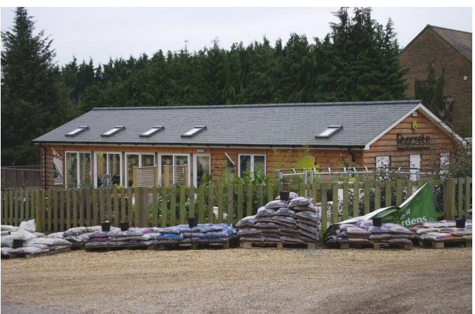
Newly Built Offices, ideal for Relocation Of Our Portsmouth Office