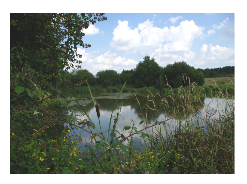
The small lake which produced a lovely 25lb Common Carp for the first time this year