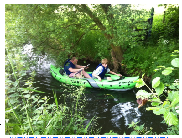
Canoeing down our section of the River Meon, which runs central to our whole rural centre. It's a real adventure when you are from an inner city area!

Its been a strange year, often dictated by our income. We are now into our 6th financial year that has been effected (maybe that should read infected) by the recession. I had thought we had beaten it and we were steadily increasing our income each year working towards getting back to our pre recession levels. We then entered the summer months and July to September were disastrous for income and all the meagre reserves we had been trying to build disappeared. It seems the recession is still with us and many people although largely unaffected by it are still choosing to keep their disposable income in case there is still a rainy day to come! We have kept really busy however and although we have