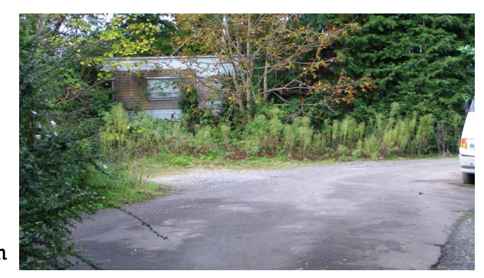
Upper Mobile Home, 29 Years Use, Planning Established. Ideal Safe Haven Accommodation, if Replaced

Clearly we cannot do this on our own, we need your help. There will be one or two that read this that could make the whole project possible on their own, there will be a few more who could make substantial progress on the project by raising the interim payment that would buy a modest retirement property. Their are a few more still that although they are not in the position to personally donate have access to funds, companies and individuals who might. There are also some who will have a great idea for raising