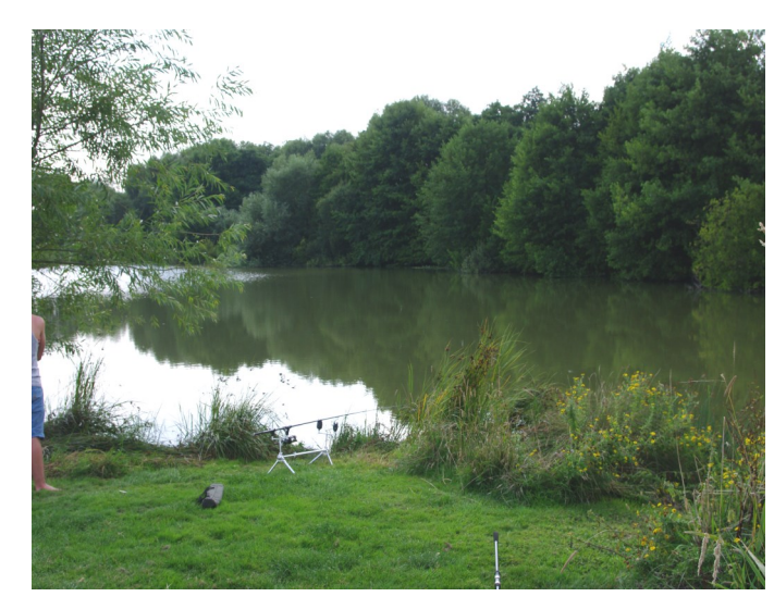
The main lake in the midst of a camping and fishing week