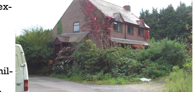
House On Site, A Residential Presence Would Make A Huge Difference To Security, Safety and Work Supervision

In Solent Nurseries we have the opportunity to teach the children new and transferrable skills, with the nursery up and running again we can run mini enterprises with the children where they grow their own products and then sell them, this will teach children who are often bright but with no qualifications at all, entrepreneurial skills that they can apply to any enterprise that will give them employment. We are thinking Koi Carp will also be a product they could