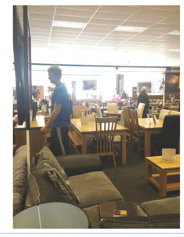
Our Temporary Shop At Hedge End, Southampton, We Moved Out During June

For much of the year we took a temporary lease out on a large shop in the Hedge End shopping area to sell goods that had been donated to us, both new and second hand. It generated a useful income for us but perhaps even more importantly provided us with employment, work experience and life skills opportunities for our older youngsters.