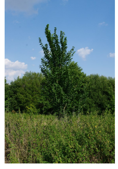
The Dutch Elm Resistant Trees we planted 2 years ago are now beginning to establish themselves In Our Nature Reserve.